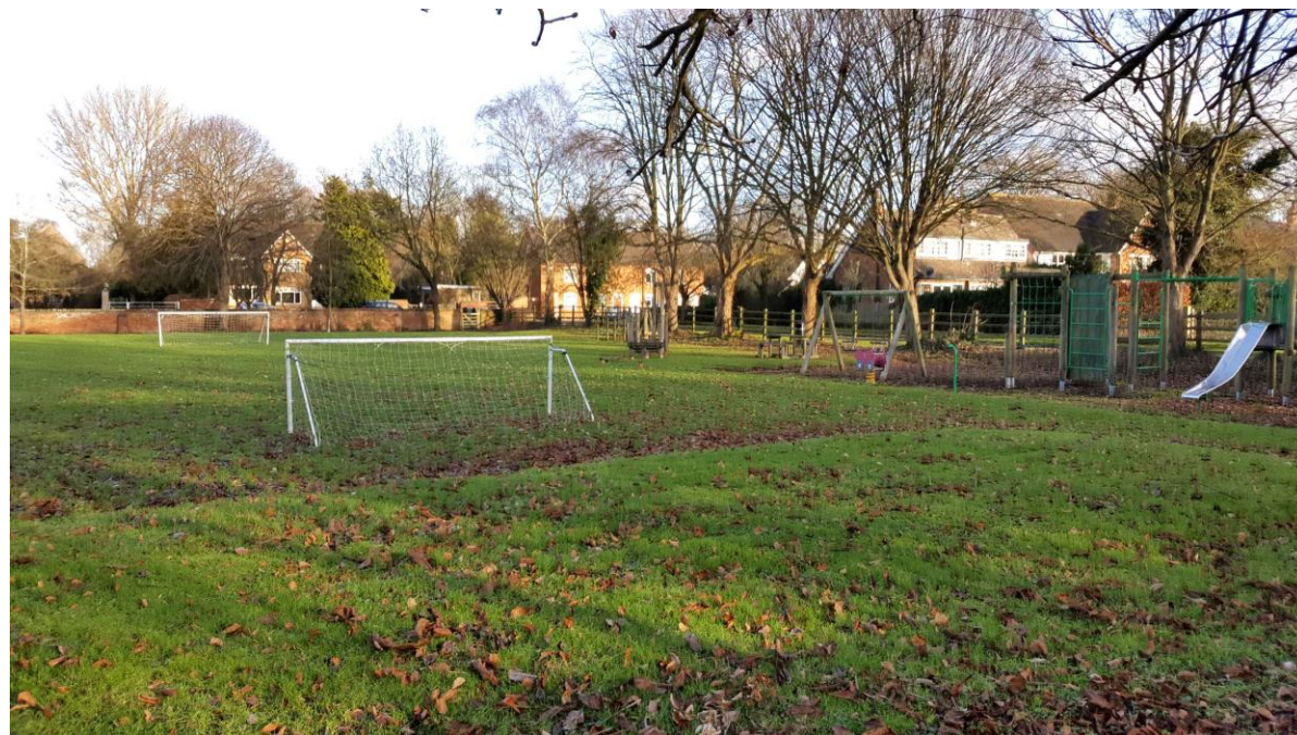
Taken in January 2018